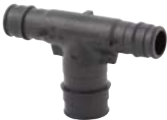
EP Reducing Tees