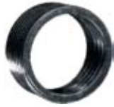
Mission Shower Drain Gasket