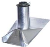
Roof Cap Galv Slant