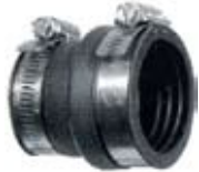
Drain &amp; Trap Connector