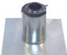
Roof Cap Galv Flat