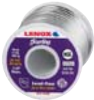
Lenox/Sterling Lead Free Solder