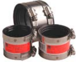
Mission Band-Seal Shielded Transition Couplings