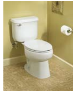
Windham EB 402315