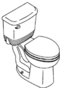
Riverton PB 402502