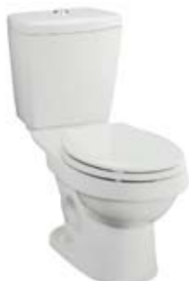
Rockton EB 402028