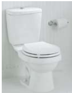
Karsten PB 402025