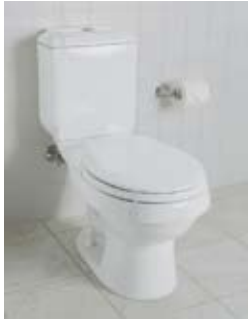
Rockton PB 402024