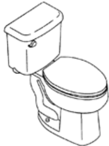
Windham EB 402215