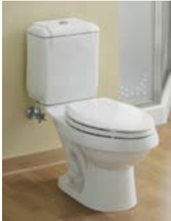
Rockton EB 402027