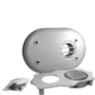
SP20285 & SP20286