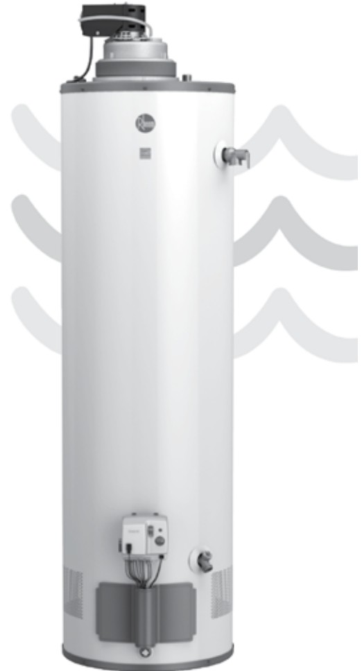
XR90 29-Gallon Capacity 60,000 Btu/h Natural Gas

*See Residential Warranty Certificate for complete information