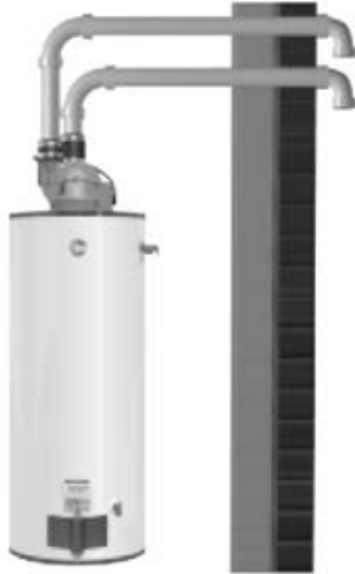
(Concentric Vent Kit Available)